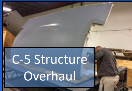
C-5 Structure Overhaul