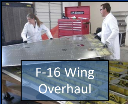
F-16 Wing Overhaul