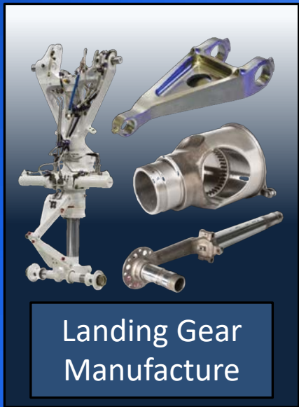
Landing Gear Manufacture