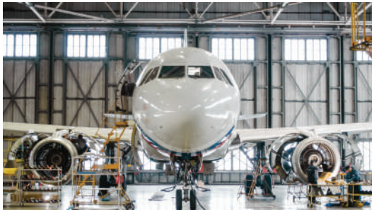
Major Airlines / Cargo

Various sectors have deployed our products for their aircraft maintenance and fleet management