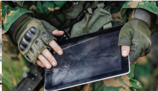
Government & Defense