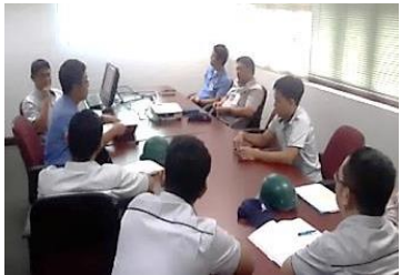
Cost Reduction (1 time/w)

Many other Improvement Activities & We often join some Competition