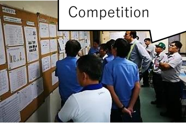
SQDC Indicators Management