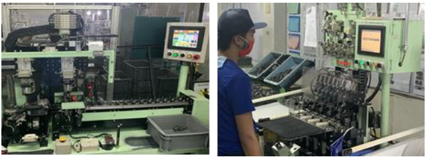
Assy & Sorting Rank