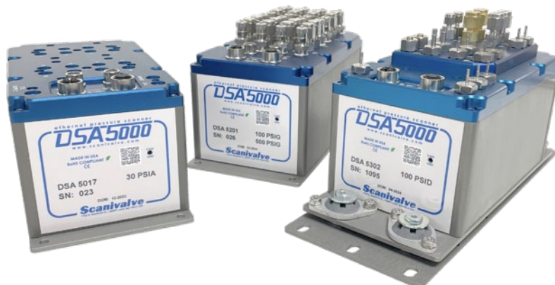
From Left to Right: DSA5000 - Standard Gas, DSA5200 - All-Media, DSA5300 - Gas / iDDS with "QD" Header and Shock-Mount