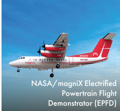
NASA/magnIX Electrified Powertrain Flight Demonstrator (EPFD)