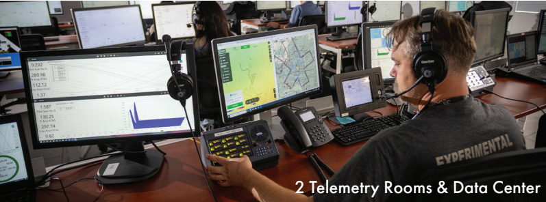
2 Telemetry Rooms & Data Center