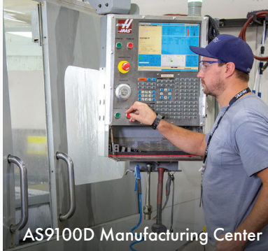
AS9100D Manufacturing Center