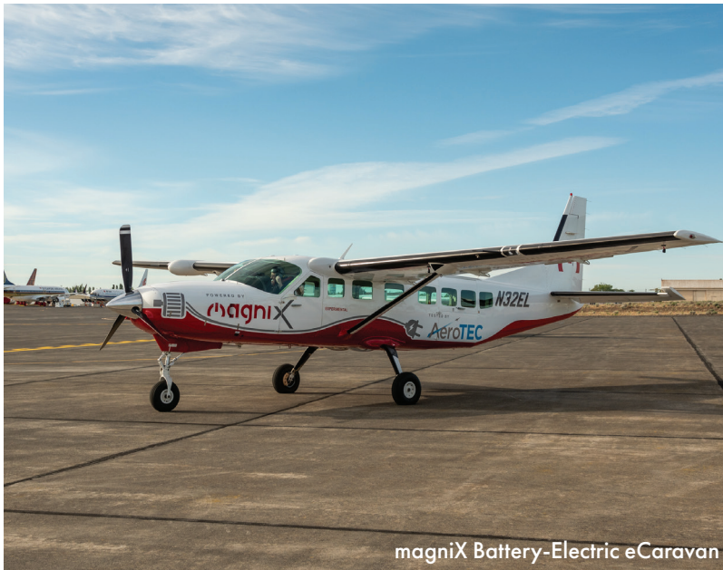
magnIX Battery-Electric eCaravan