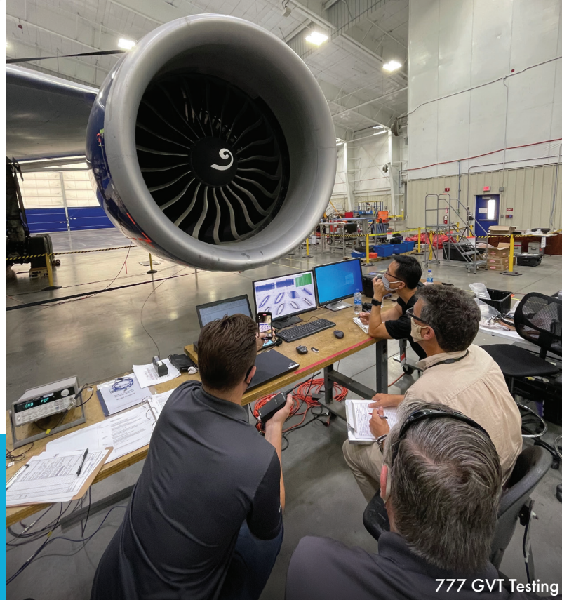
777 GVT Testing