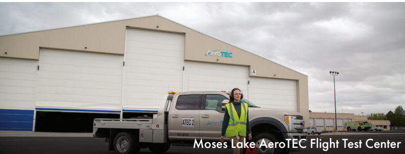
Moses Lake AeroTEC Flight Test Center