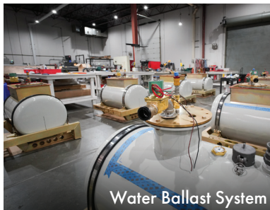
Water Ballast System