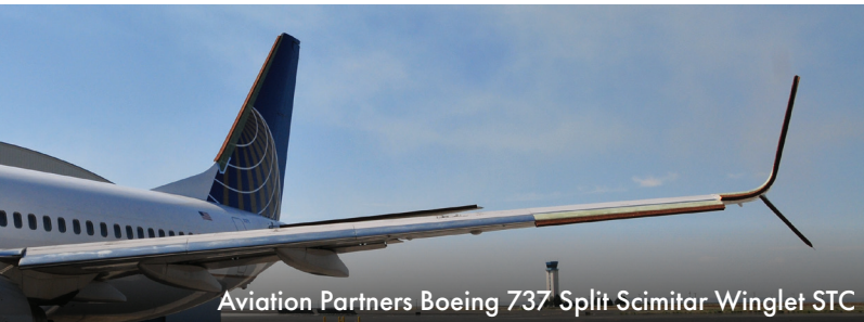
Aviation Partners Boeing 737 Split Scimitar Winglet STC