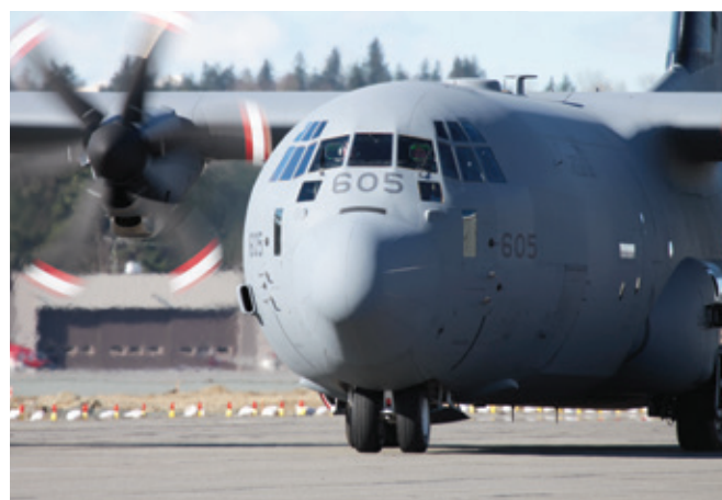
Front Cover Images: Top right: Topflight Elite Training & Charters Bottom left: MDA Corporation Bottom right: Coulson Aviation